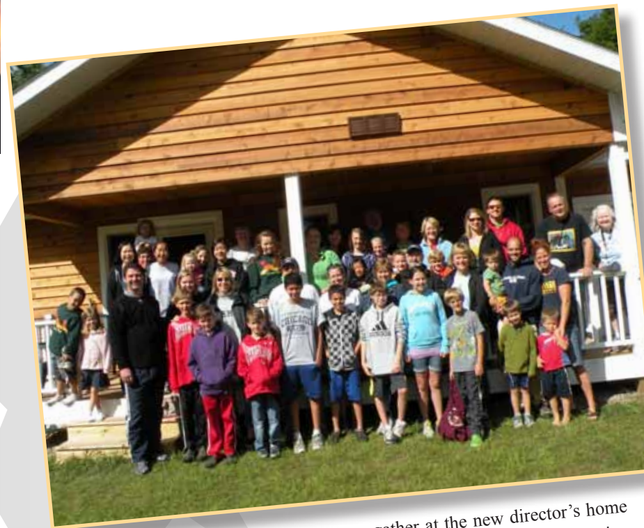
A group of family camp volunteers gather at the new director’s home after a week of service and a special time of praying for God’s blessing over the home.