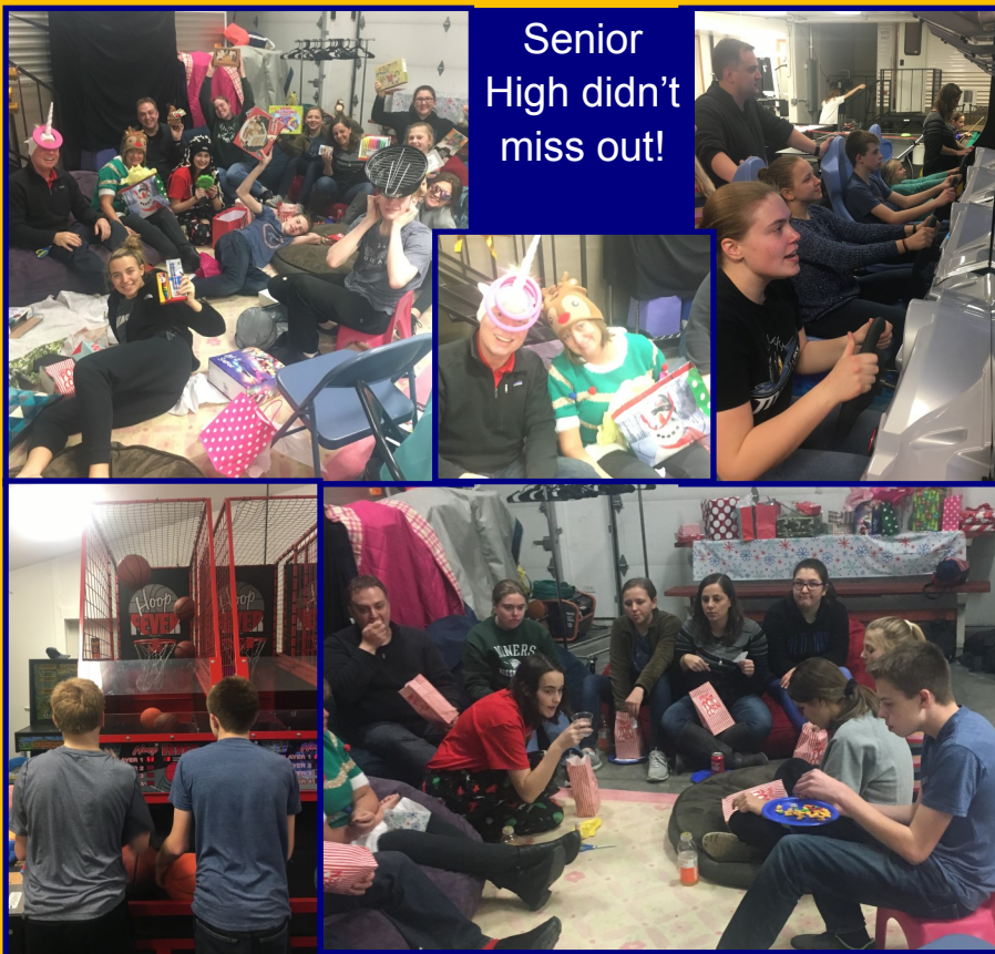
Senior High didn't miss out!