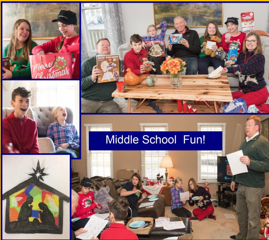
Middle School Fun!