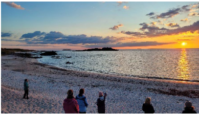
Sunset on Iona's northern beach

As we begin the new year together, we enter the Season of Epiphany, celebrating Jesus as the Light of the World, the Wise Men following the Star, and the Incarnation. This year, we have the privilege of hearing from different preachers, singing different songs in different styles, sharing prayers together in different ways, and all the while celebrating Jesus, the Light of the World. Join us for worship every Sunday at 10:30am in the sanctuary or on our YouTube channel .