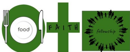
food.faith.fellowship - LCC FUN!